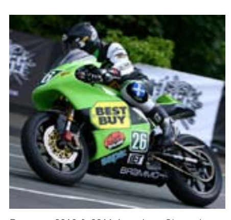
Brammo 2010 & 2011 American Champions

Developments are happening very quickly. At a recent race at Laguna Sea in the USA the fastest MotoGP bike (the F1 equivalent in the two-wheeled world) qualified just ten seconds a lap quicker than the fastest electric bike. Even a year earlier the gap would have been closer to double that.