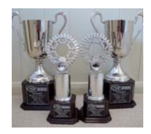
BSB 2010 - Race wins & lap records

Working with a television production company to produce a documentary following the design and development of the machine all the way through the challenges of the first race meeting.