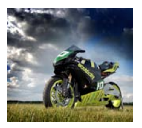
Ecotricity Ion Horse - Leading British entry

Options on a second documentary covering the full European championship season plus the World Championship finale in the USA are also being discussed.