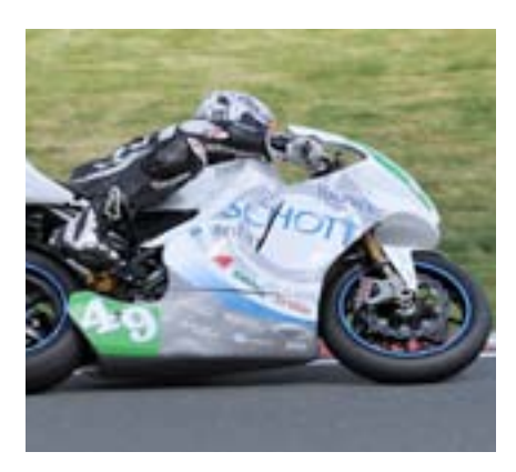
Münch 2010 & 2011 World Champions

Remove the limitations of a bulky petrol engine and you have an amazing opportunity to create something truly groundbreaking.