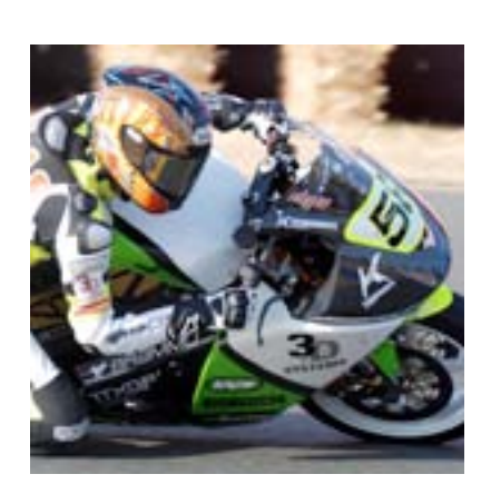
Brammo Empulse RR - Racing Green

Motec Europe – UK based market leader in automotive electronics for leading motorcycle racing teams at British and World level. Support engine management, traction control strategies, data logging and other capabilities.